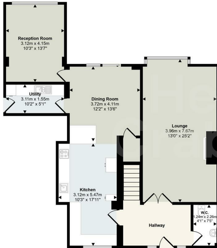
Ground Floor Approx 98 sq m / 1057 sq ft

Approx Gross Internal Area 199 sq m / 2140 sq ft